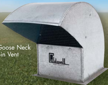
Goose Neck Bin Vent