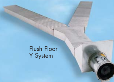
Flush Floor Y System