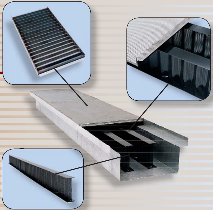
Bottom view of panel grate

unrestricted air flow. Caldwell can also design a custom fit to ensure proper air flow. Panel Grates are available with internal I-beams (which incorporate a perforated web) for heavier loads. Flush Floor Systems are manufactured with modular components for ease of installation.