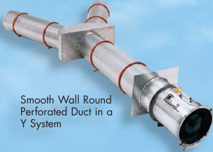
Smooth Wall Round Perforated Duct in a Y System