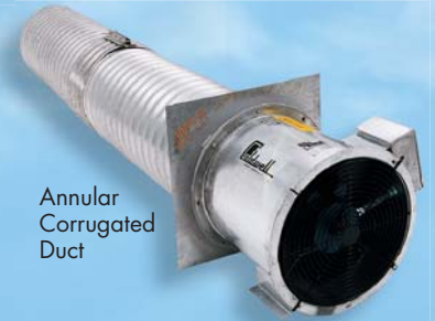
Annular Corrugated Duct