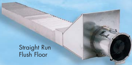
Straight Run Flush Floor