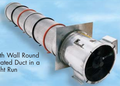
Smooth Wall Round Perforated Duct in a Straight Run