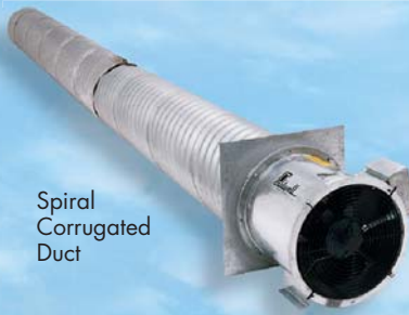
Spiral Corrugated Duct