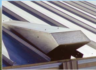
Low Profile Roof Vent